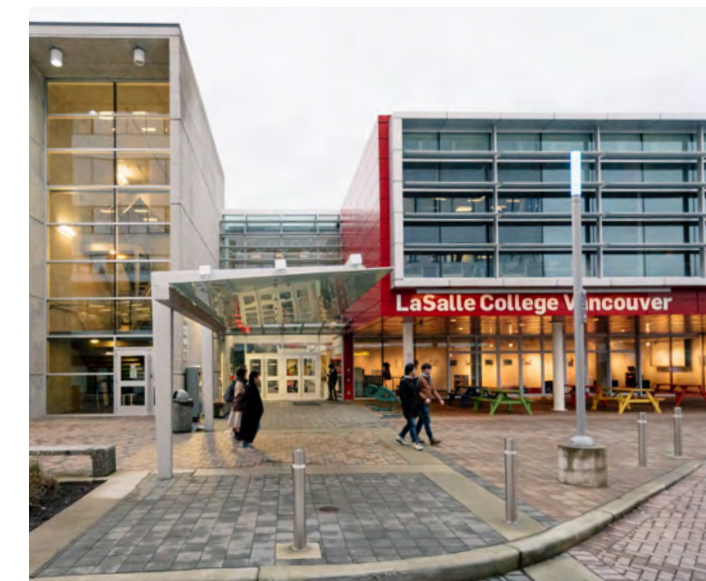
Located at the LaSalle College Vancouver campus

LAB Vancouver is a one-of-a-kind English language school. Your classes are provided in an 80,000 square foot building where we share the campus and facilities with our sister college, LaSalle College Vancouver, and our international high school. Located steps away from Renfrew Station, your experience is a real immersion in a real part of Vancouver.