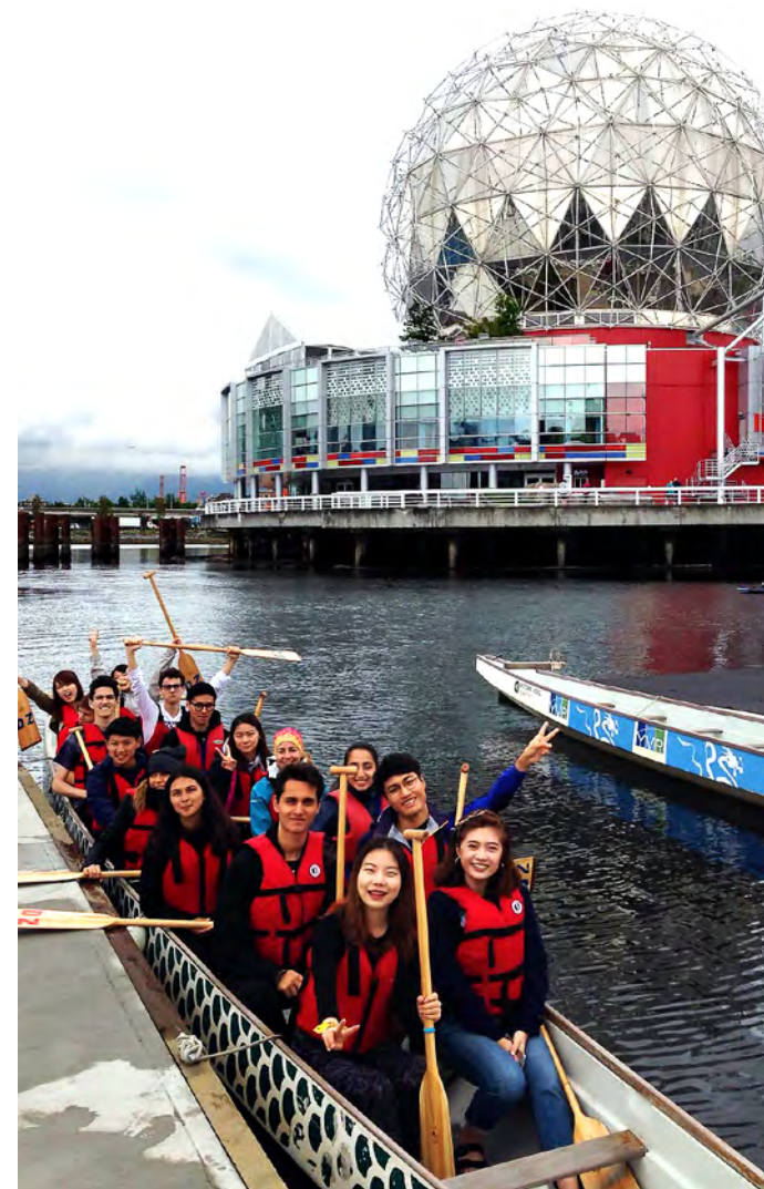
Social Life at LAB Vancouver

Located between the ocean and the mountains, with parks and beaches surrounding its harbour, this picturesque city with spectacular green views attracts visitors from all around the world. With modern conveniences that include trendy restaurants, convenient public transportation, and multiple shopping and entertainment districts, Vancouver has a lifestyle that you will easily adapt to and enjoy.