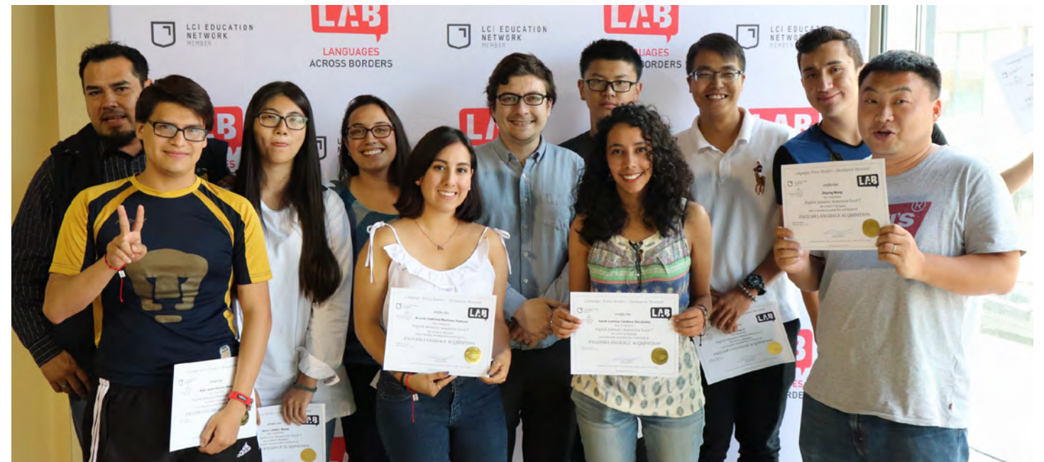
Located at the LaSalle College Montréal campus