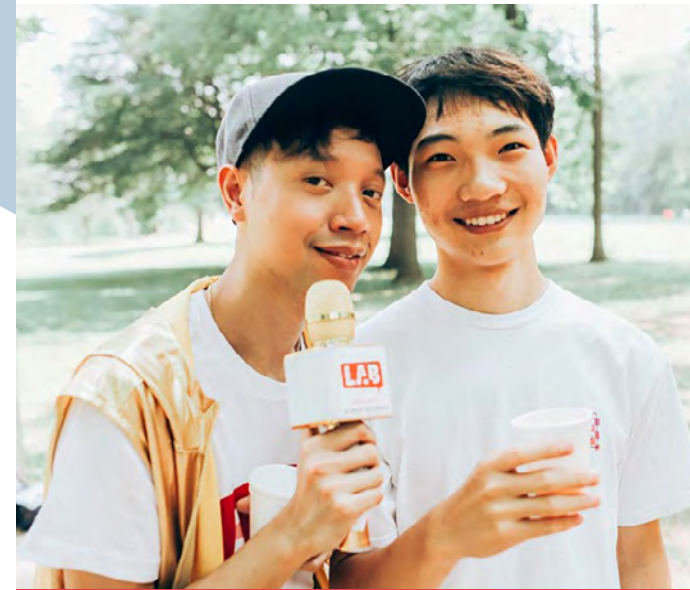
Language programs offered in English & French

Founded as a language school in 1997, LAB Montréal is accredited by Languages Canada and shares a modern campus with LaSalle College in downtown Montréal. Our campus is conveniently located in a district known for shopping, restaurants and cafés – all within walking distance of Montréal's subway network. Our dedicated teachers and staff will guide you through the learning process and offer support to help you meet your goals. Improve your language skills and make new friends in this vibrant and friendly campus now!